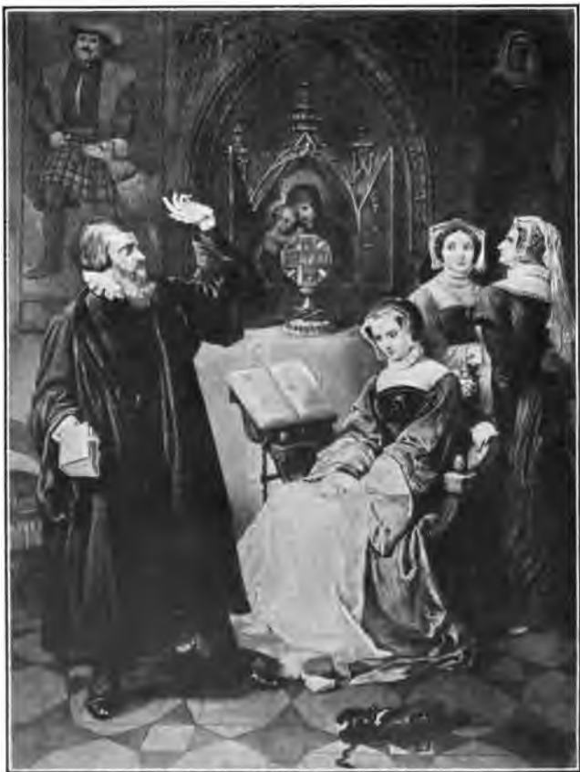
KNOX AND MARY, QUEEN OF SCOTS .From an Engraving in the Presbyterian Historical Society